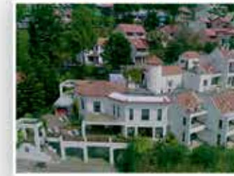
HOTEL PINE CREST • Bhowali • Type Hotel