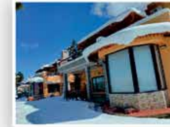
THE ETHERIA • Dhanachuli • Type Villas