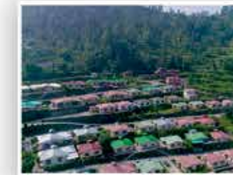
RAKSHA RETREAT • Sattal • Type Villas