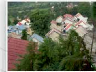
DILBAHAR COTTAGES • Farsoli • Type Cottages