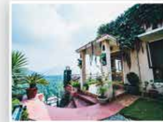
NIRVANA AT SUNNY LAKE • Bhimtal • Type Villas