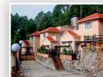
SUNNY LAKE PHASE 1 • Bhimtal • Type Apartments