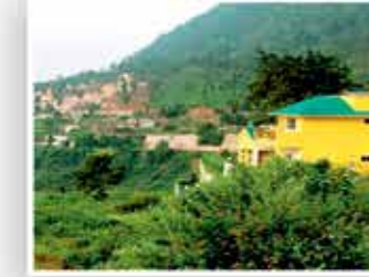
VALLEY VIEW COTTAGES • Bhimtal • Type Villas