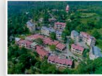
PINE GREENS • Bhowali • Type Aartments & Villas