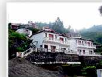
KRISHNA HERITAGE • Bhowali Road • Type Cottages