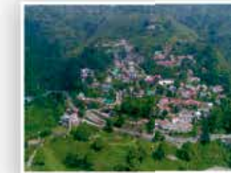
GOLUDHAR • Bhimtal • Type Villas