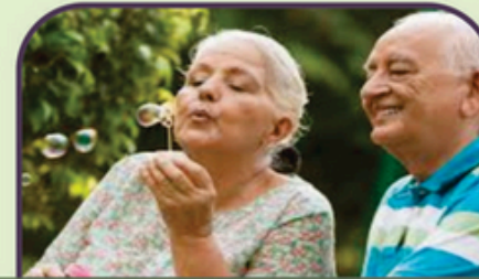
Senior Citizen Park