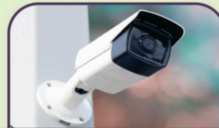
CCTV Surveillance System