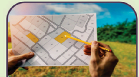
Each Plot Demarcation